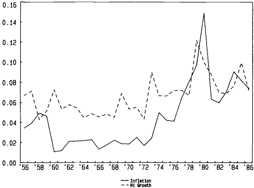
Fig. 5.1 Variability of money growth and inflation; 20 OECD countries; 1956–1986. Note: Figures are standard deviations of annual data for each country.

being particularly dramatic. 8 Figure 5.2 shows sizable increases in inflation and in interest rate variability at approximately the same time as the increases depicted in figure 5.1, but no overall uptrend in the variability of actual money supply growth. Taken as a whole, therefore, these data are consistent with the hypothesis that national policies have become more autonomous. The one seeming anomaly is the variability of money supply growth under the floating exchange rate regime in the subsample. Further evidence on this issue, and on the variability question in general, is presented in table 5.1.